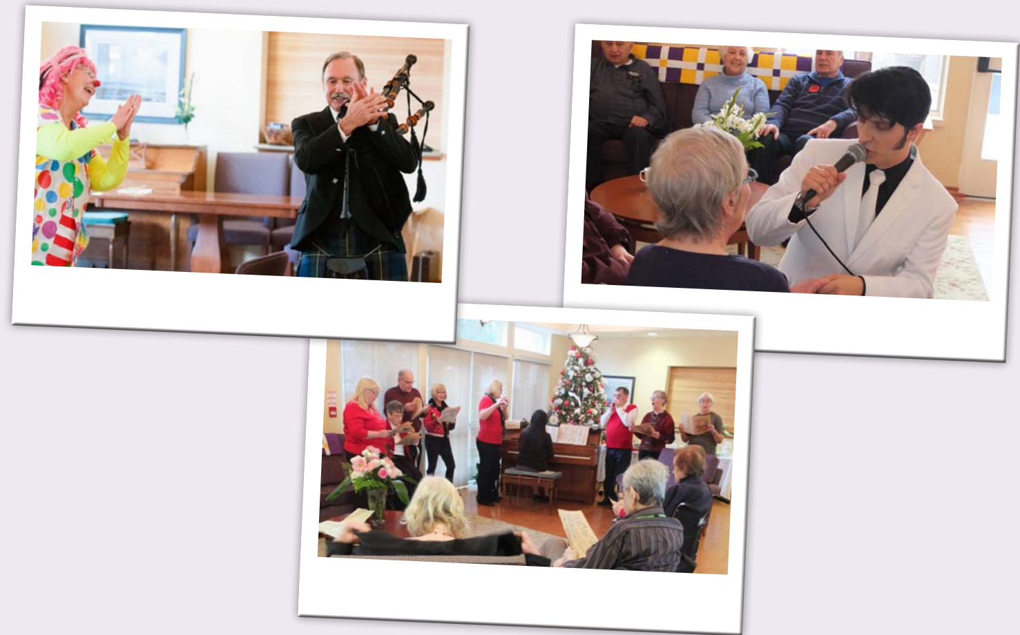
Music at the Hospice