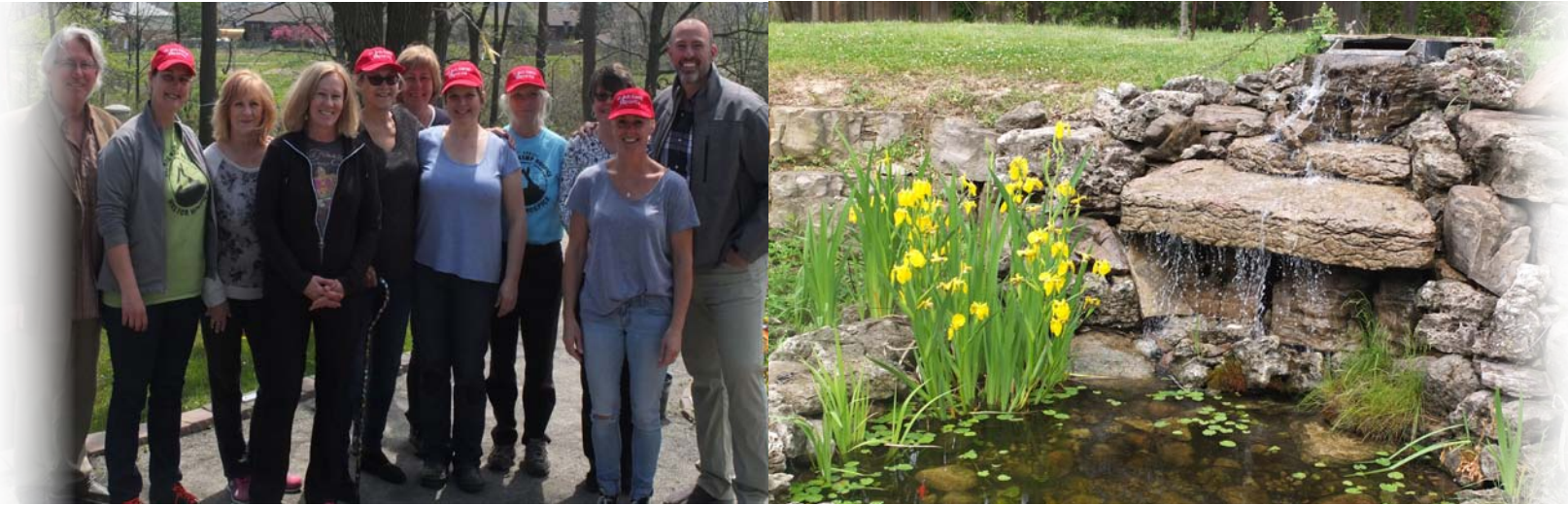
Garden volunteers and celebrity guests

“I could not say enough about the excellent care and compassion from all the staff. Just thanks for the tremendous service you have been providing to us and so many others.”